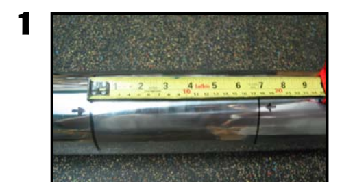
4" Exhaust Only