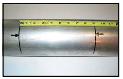
5" Exhaust Only

Select a location that has a minimum of 12" of straight pipe and has sufficient clearance for installation and servicing of the exhaust brake. This location should be as close to the turbocharger as possible and away from dirt and road spray. A 7" section of exhaust pipe needs to be removed. Measured and mark the pipe for cutting.